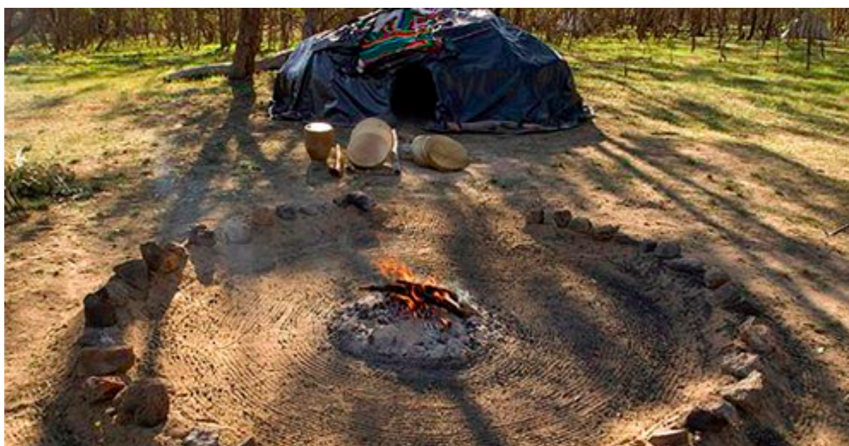
Winter Medicine Sweat Lodge Season

http://cecilshub.com/event/om-chanting-circle-northside/?instance_id=33